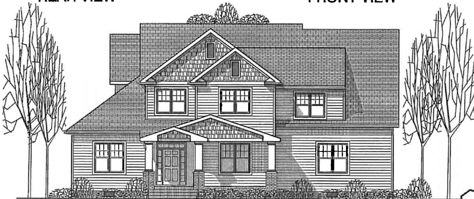
THE ROSEMONT I