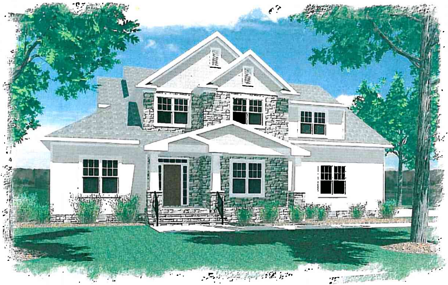
THE ROSEMONT I